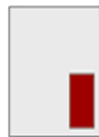
1/6 portrait type size