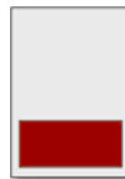
1/3 landscape type size