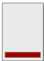
1/8 landscape type size