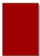
Cover II, III, IV