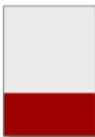
1/3 landscape bleed size