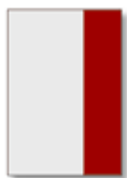
1/3 portrait bleed size