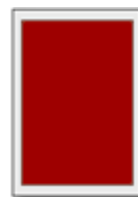
1/1 type size