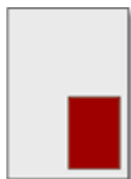
1/4 portrait type size