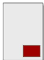
1/8 portrait type size