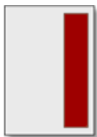
1/3 portrait type size