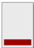
1/6 landscape type size